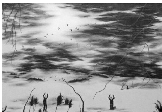
The Pre-Conference with an Unfair Fight in the Back , 2004, pencil on paper, 7.5" x 10"